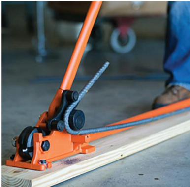
Bend 90° in a single bend 180° in two