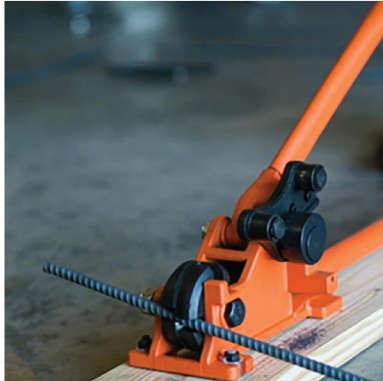
Two cutting slots Designed for #3, #4, #5 Rebar Cuts