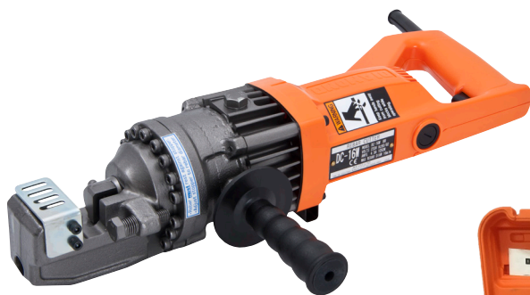
DC-16W #5 Rebar Cutter