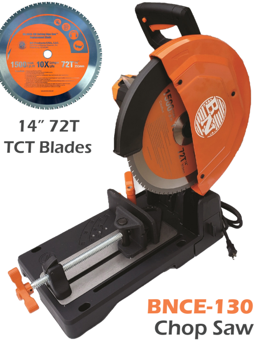
BNCE-130 Chop Saw

The Cutting Edge Saw™ Series by BN Products-USA™ is a popular tool for cutting rebar and other materials, known for its ability to make clean, burr-free cuts with minimal sparking. It's a cold-cutting saw, meaning it minimizes heat and sparks during the cutting process, resulting in a cool-to-the-touch cut. The saw is available in both corded and cordless (24V) versions.