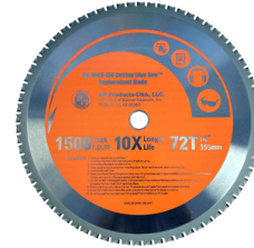
14" 72T TCT Blades